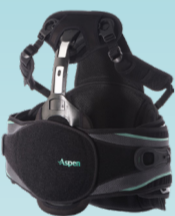
Vista 464 TLSO