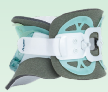
Vista II Collar