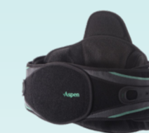
Vista 637 LSO Vista 637 LSO LoPro