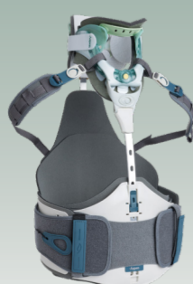
Vista II CTLSO