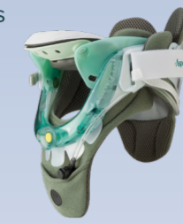
Vista Multipost Therapy Collar