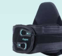
Horizon PRO 637 LSO Horizon PRO 631 LSO