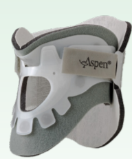
Aspen Cervical Collar Aspen Paediatric Collar