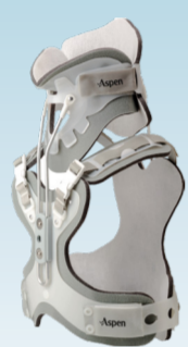
Aspen CTO Aspen Paediatric CTO