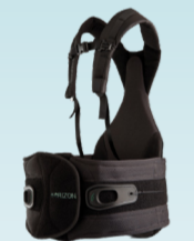
Horizon 456 TLSO