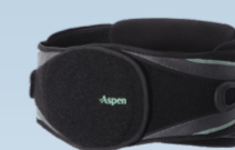
Vista 627 Lumbar