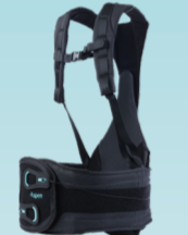
Horizon PRO 456 TLSO