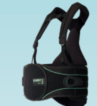
Summit 456 TLSO