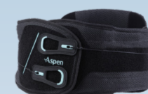
Horizon PRO 627 Lumbar