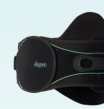
Summit 637 LSO Summit 631 LSO