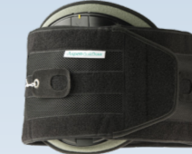
QuikDraw RAP QuikDraw PRO