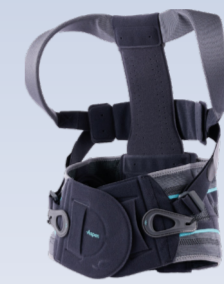
Aspen Elite TLSO