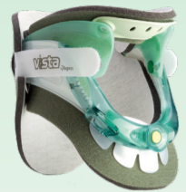
Vista Collar Vista ICU (Back Panel Only) Vista TX Collar