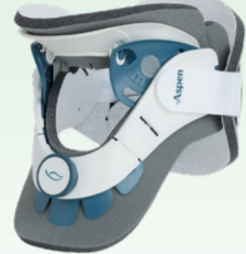
VRTX Collar VRTX Multipost Collar VRTX TX Collar