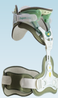
Vista CTO Vista CTO4