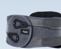
FLX 627 Lumbar