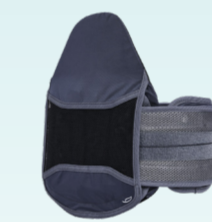
FLX 637 LSO FLX 631 LSO