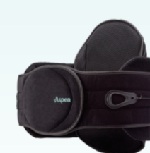
Aspen Sierra 637 LSO