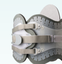
Aspen LSO Aspen LSO LoPro