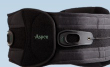
Horizon 627 Lumbar