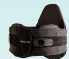
Horizon 637 LSO Horizon 631 LSO