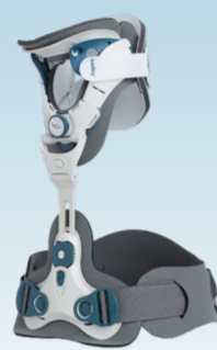
VRTX CTO VRTX CTO4