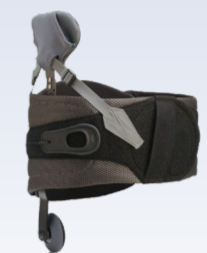
Aspen Tri-Point FSO